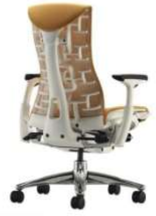
would have one not, but the $1,077.00 price tag has me looking for an alternative solution to comfort.

http://embody.hermanmiller.com/#/home/embody