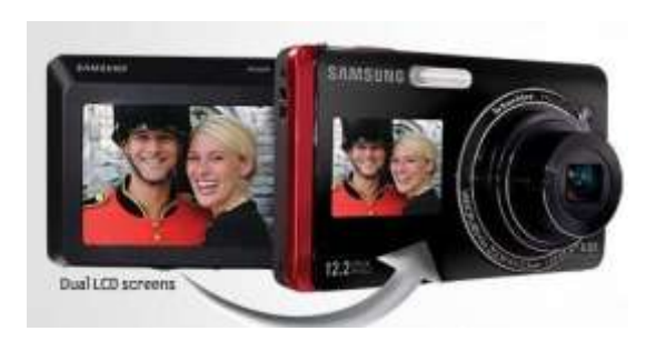
Sony Cybershot TXT