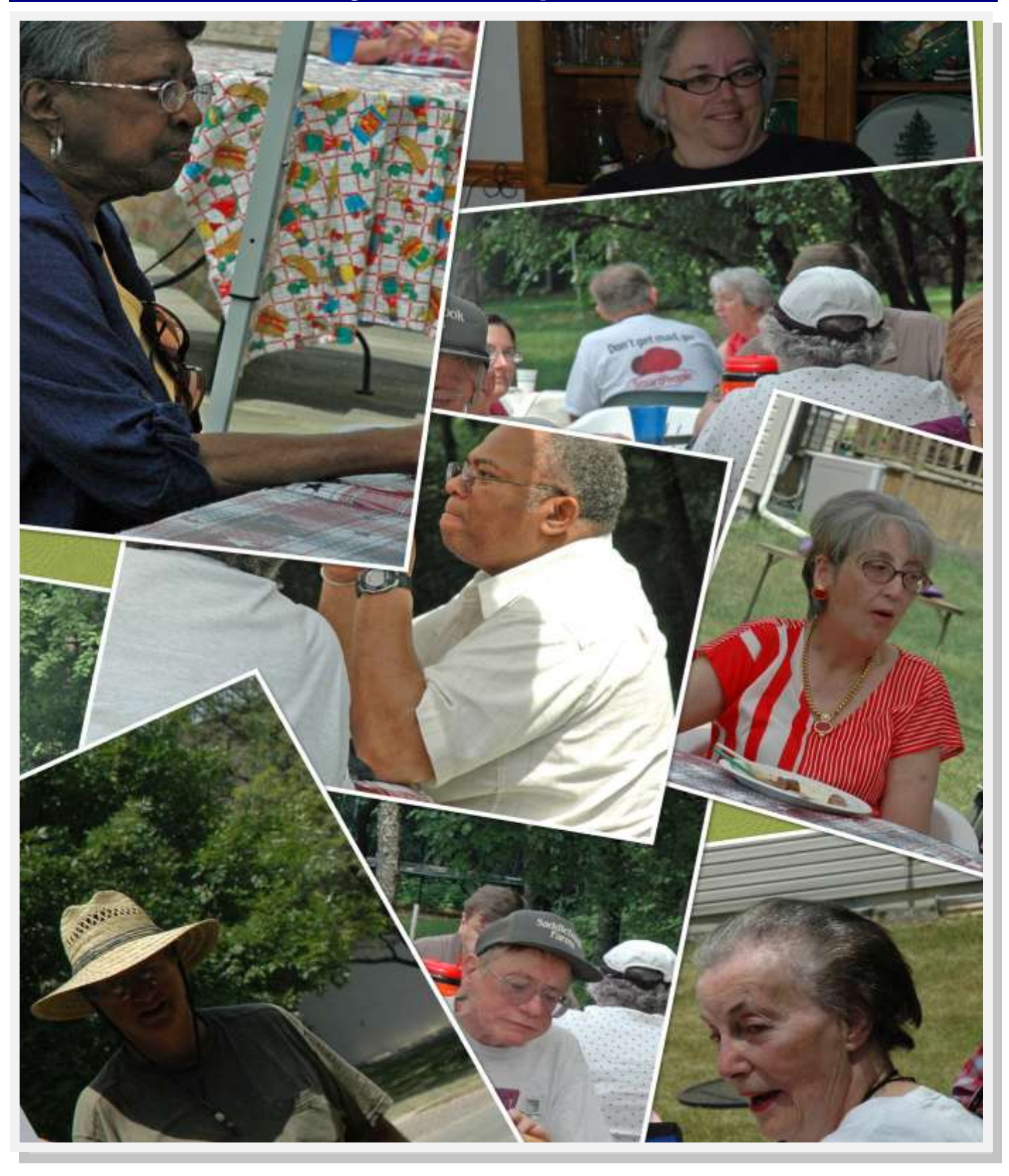
Picnic 2011 Good Food Good Conversation and Great Club