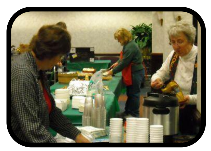
Setting up the food table.

And here's 4,000 words worth of pictures .