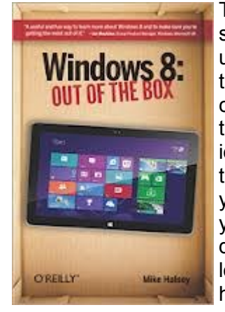
(Continued from page 6)

This book is best suited for someone who is starting to Goina use Windows 8. through the book with your computer at your side so that you can try out the various tips and techniques that Halsey describes will vield the best results. lf you do not yet have a Windows 8 computer and are looking for a reference to help you understand the differences between Win-