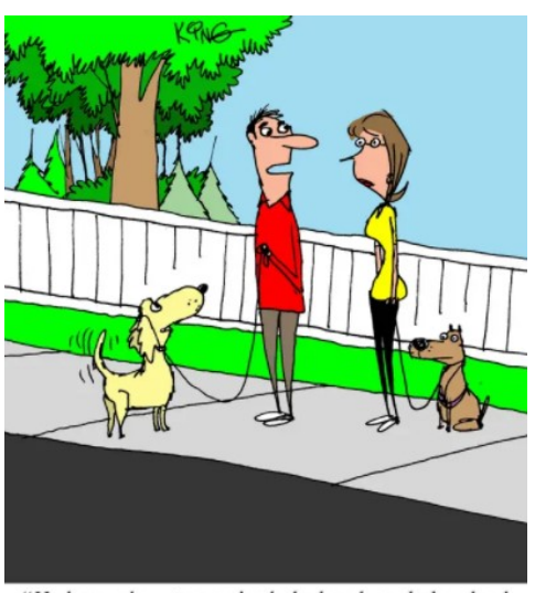
"He knows how to speak, shake hands and play dead. However, he's having a tough time with Windows 11."

Power Toys unlocks a slew of useful feature in Windows 11.