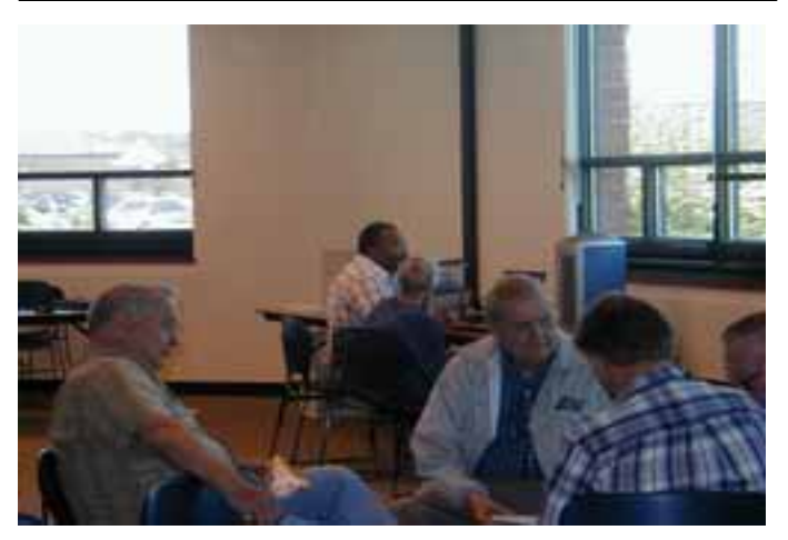
Members Helping Members

The world's smallest Web site is the size of an icon. But it contains games, a keyboard, a search engine and a Web cam. <u>http://www.guimp.com</u>