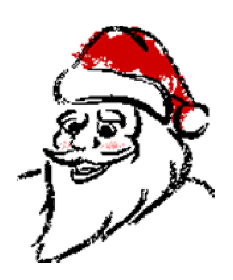
"Ho, Ho, Ho Merry Christmas"