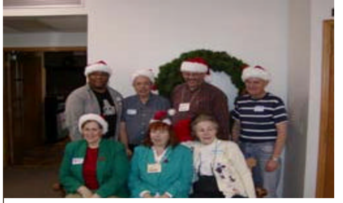
Happy New Year From Santa's Helpers