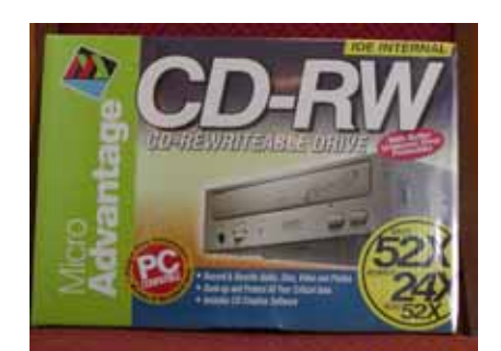
3rd PRIZE 52X MicroAdvantage CD Burner