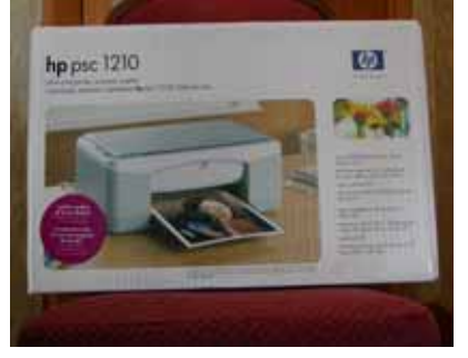
2nd PRIZE HP PSC 1210 Printer/Scanner/Copier