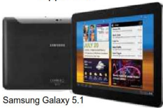
Samsung Galaxy 5.1